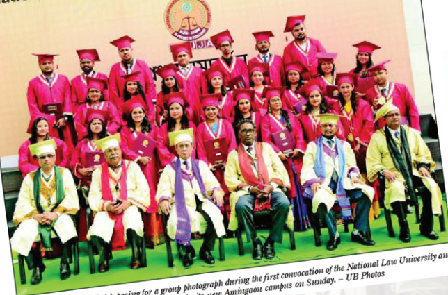
Students of the LLM Batch posing for a group photograph during the first convocation of the National Law University and Judicial Academy, Assam, in its new Amtingam campus on Sunday.

ৰাষ্ট্ৰীয় আইন বিশ্ববিদ্যালয় আৰু ন্যায়িক একাডেমী, অসম National Law University and Judicial Academy, Assam