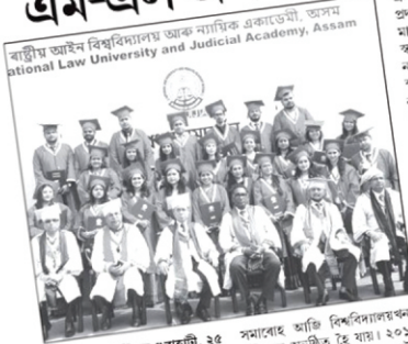
প্ৰতিদিন সেৱা, উত্তৰ গুৱাহাটী, ২৫ ফেব্ৰুৱাৰী : কামৰূপ জিলাৰ আমিনগাঁওস্থিত ৰাষ্ট্ৰীয় আইন বিশ্ববিদ্যালয় আৰু ন্যায়িক একাডেমী, অসমৰ প্ৰথম সমাৱৰ্তন