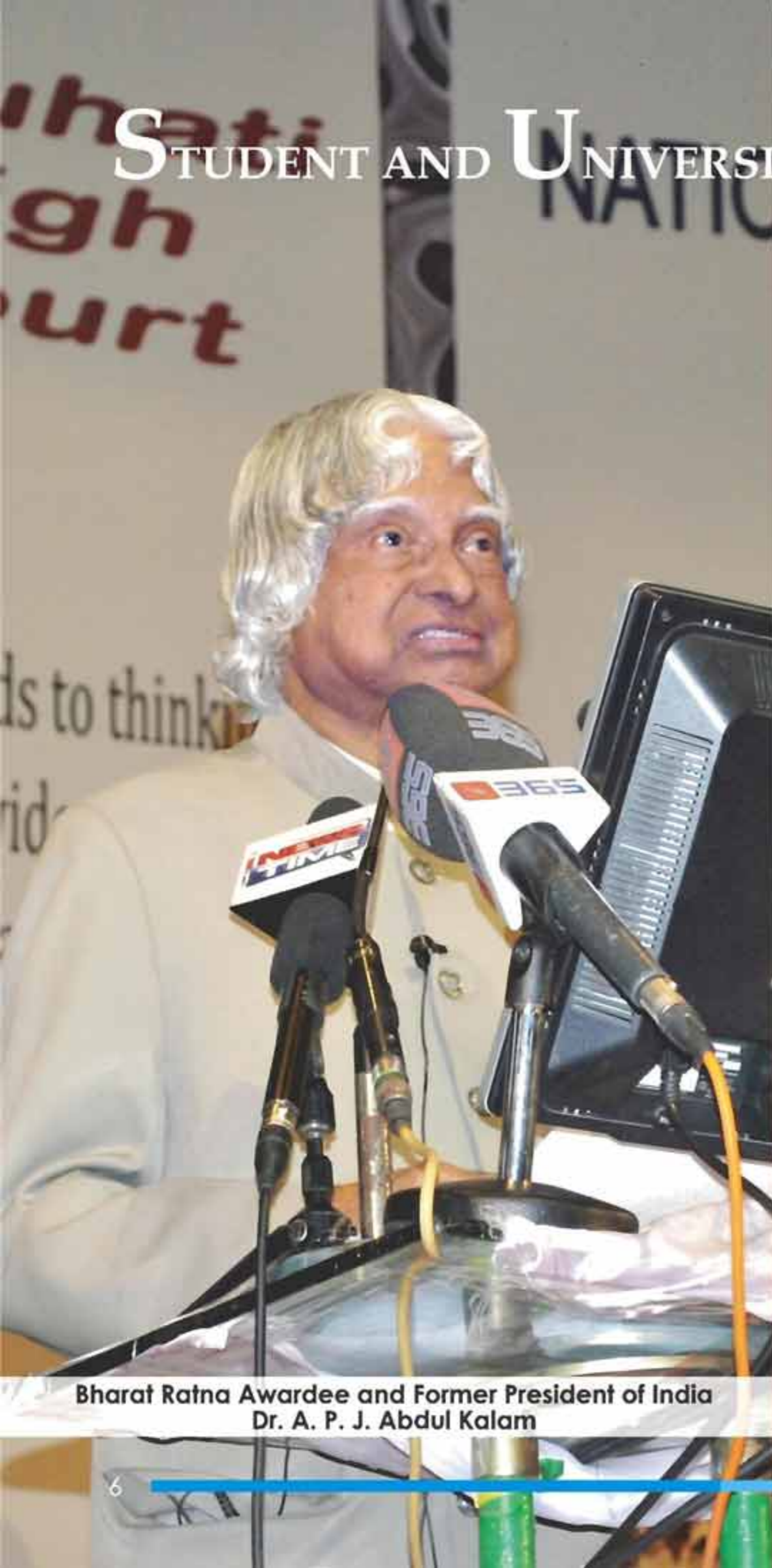
Bharat Ratna Awardee and Former President of India Dr. A. P. J. Abdul Kalam

N LU-A prides itself in being the fourteenth National Law School of the country. Since its inception, the university has been making rapid progress towards its dream of achieving excellence in the field of legal education with its dedicated faculty members, staff and students. The institution is committed to give to the society, qualified lawyers and judges, able administrators, academicians, intellectuals, distinguished leaders and socially responsible citizens. The institution is making every effort to create a healthy and conducive atmosphere in the campus which is reflected in the number of flagship programmes held in the university including national conferences, workshops and seminars. Some of the key initiatives of the institution are enumerated below: